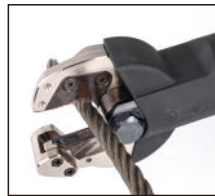
Wireropes \leq\phi 14mm