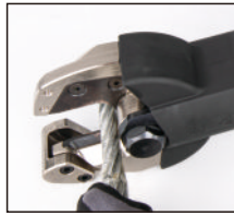
ACSR \leq\phi 26mm