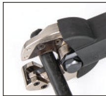
Armoured cables \leq\phi 26mm