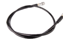
1.5m Hydraulic hose