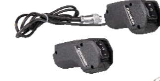
1.5m Remote controller (Wireless remote control at optional)