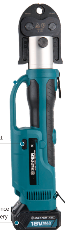
High Performance 18V Li-ion Battery