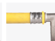
MULTI-LAYER COMPOSITE PIPE