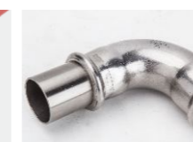
STAINLESS STEEL PIPE