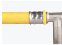
MULTI-LAYER COMPOSITE PIPE