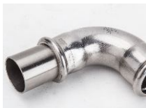
STAINLESS STEEL PIPE