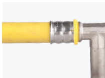
MULTI-LAYER COMPOSITE PIPE